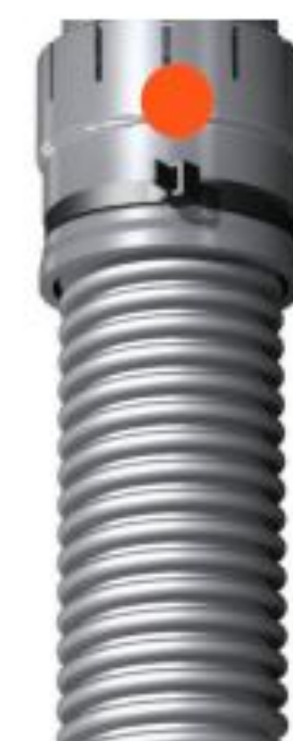
Connect Duct-Connector to Hygihose with large cable tie