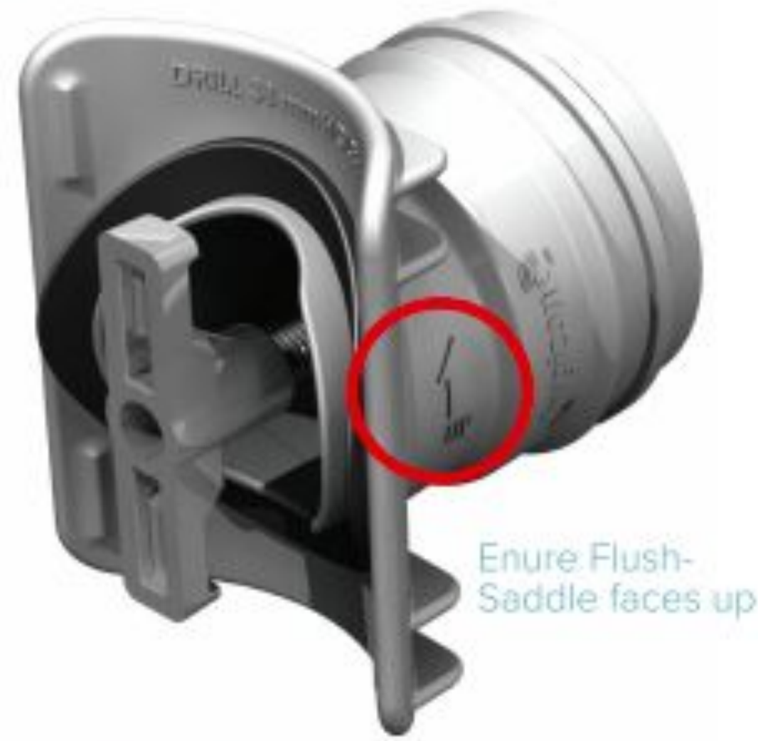
Note Flush-Pipe diameter