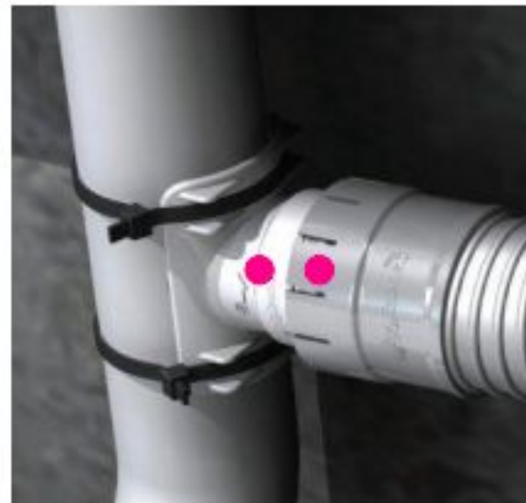
Connect 4m Hygihose to Flush-Saddle using matching colour indicators