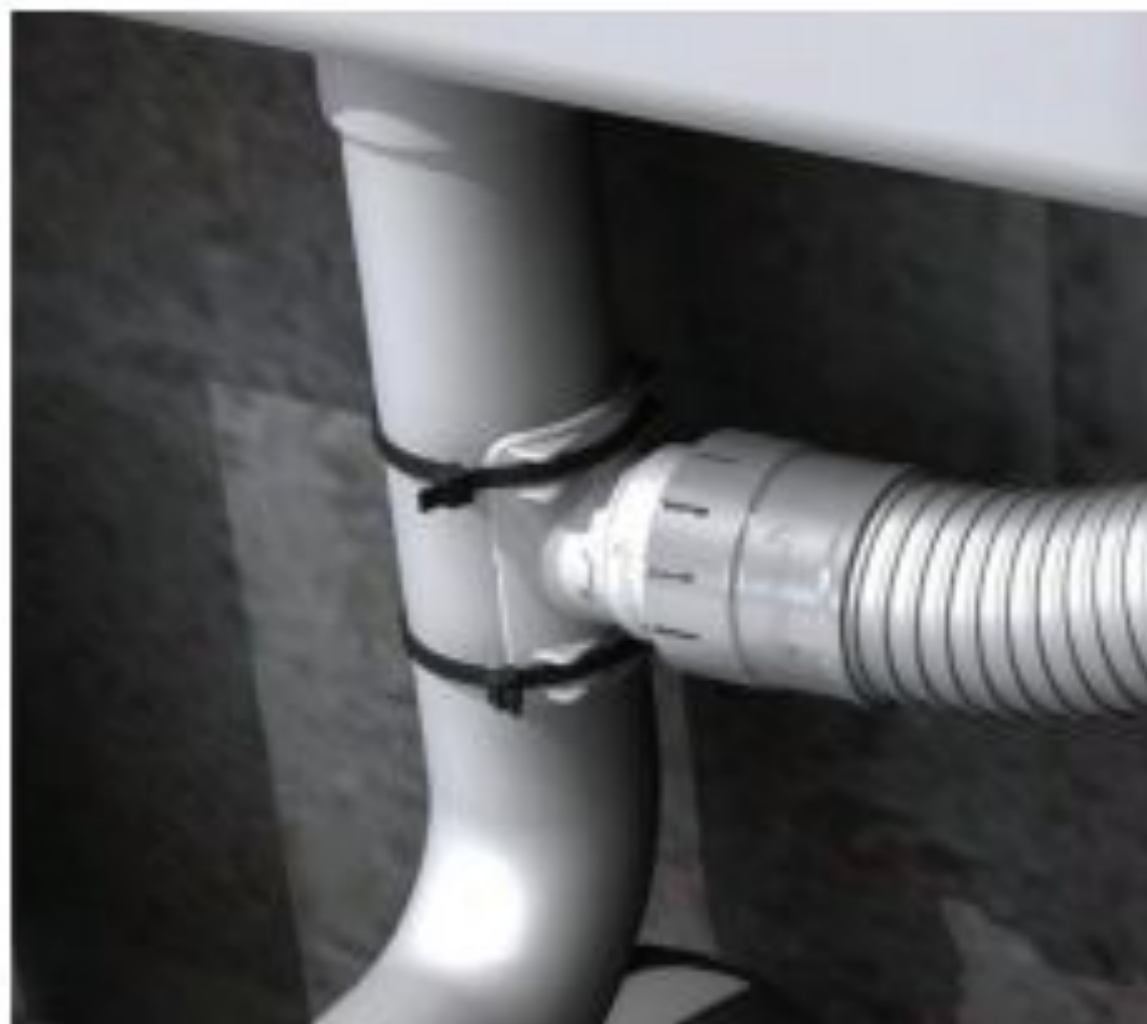
Secure Flush-Saddle to Flush-Pipe