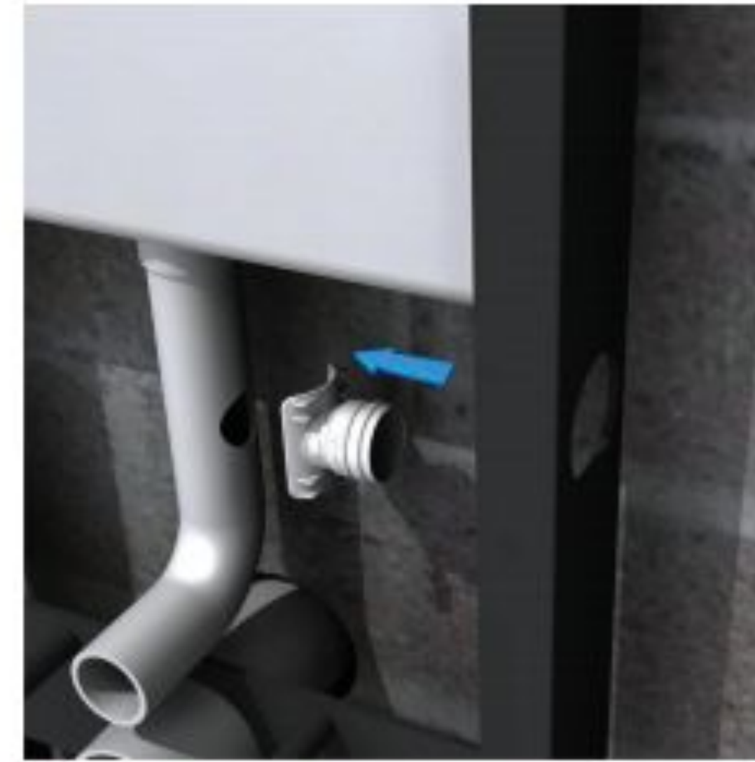
55mm Flush-Pipe - drill 38mm hole 44mm Flush-Pipe - drill 32mm hole