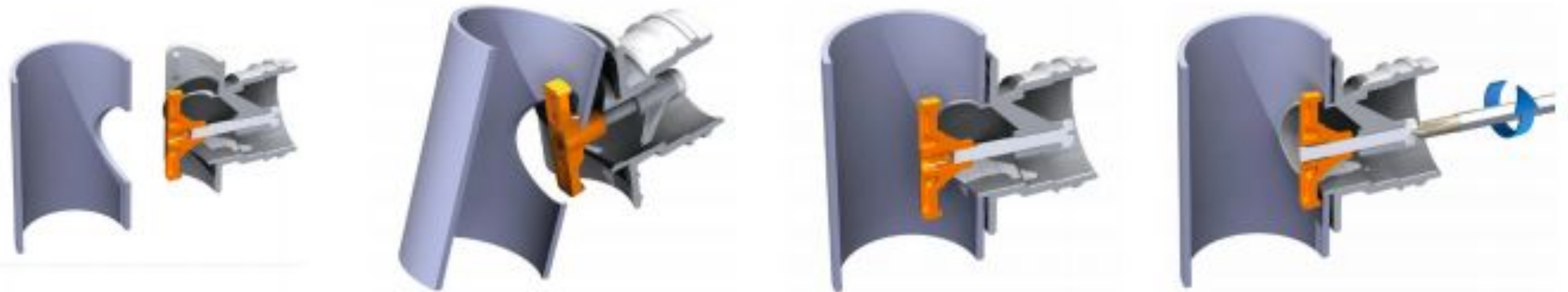
Use the T-clamp to fasten Flush-Saddle to Flush-Pipe