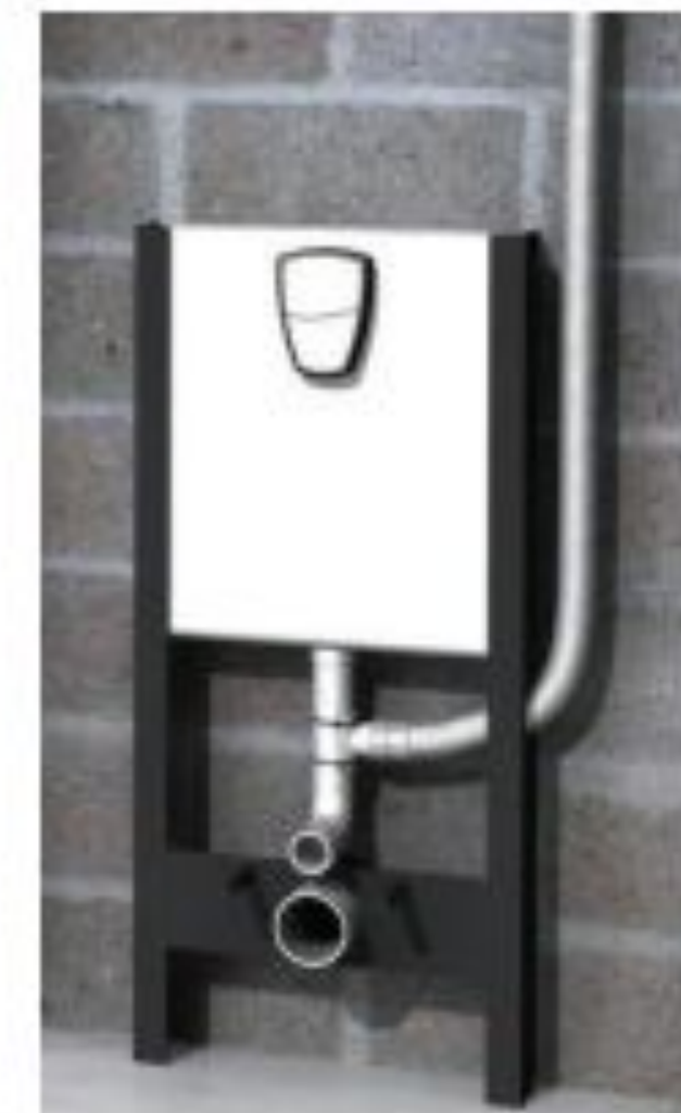
Route Hygihose to ceiling