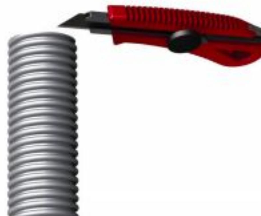
Trim Hygihose if necessary